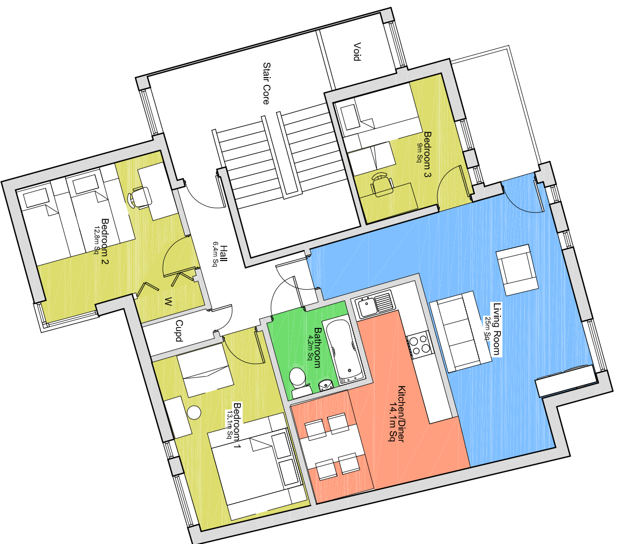
First Floor Scale 1:50 @ A1 GIFA = 92m 2