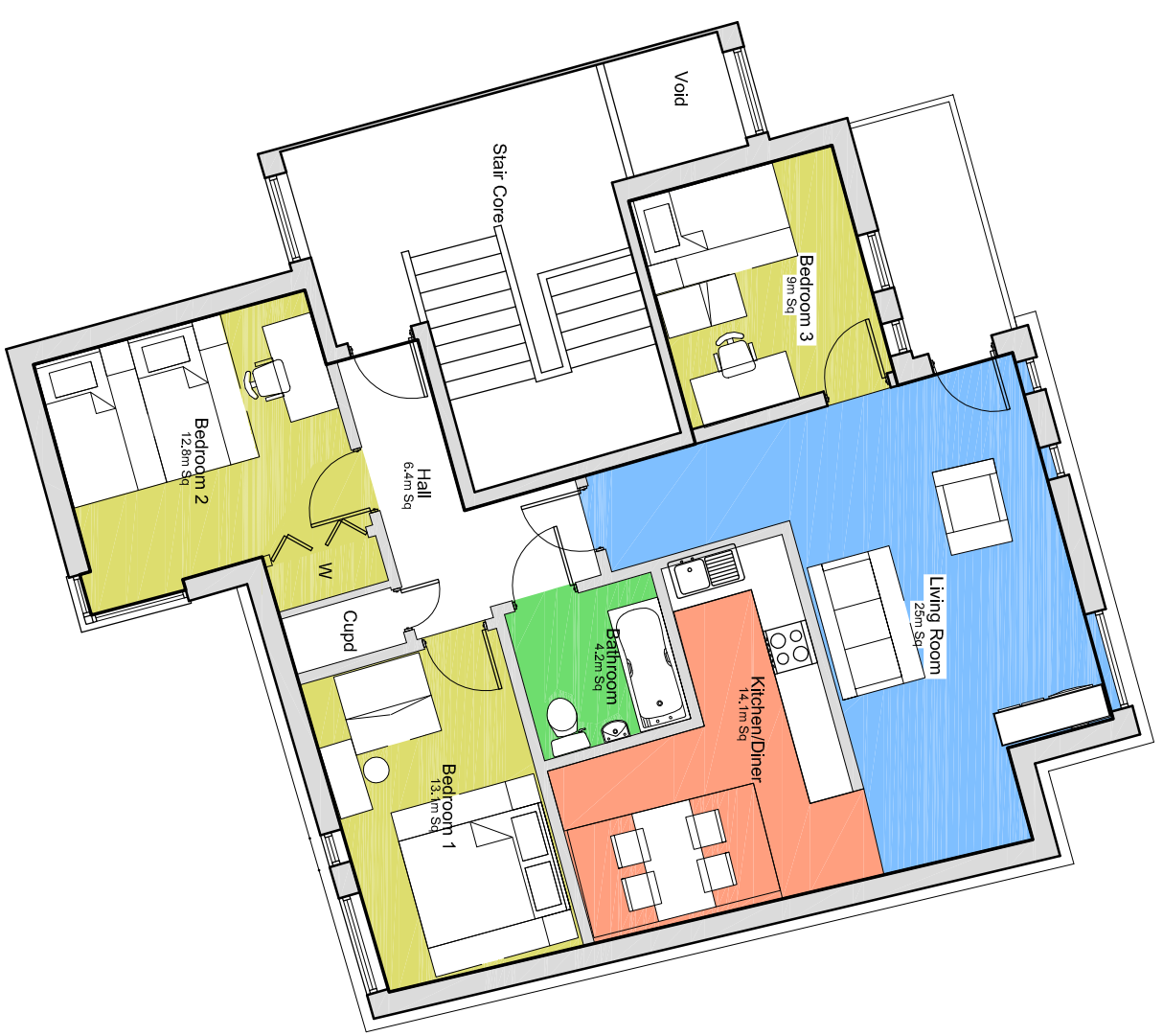
Third Floor Scale 1:50 @ A1 GIFA = 89m 2 Total GIFA = 327m 2