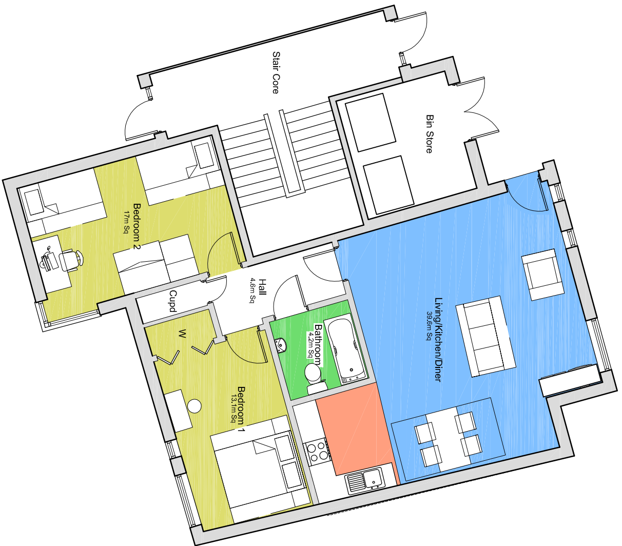
Ground Floor Scale 1:50 @ A1 GIFA = 84m 2